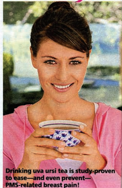
Drinking uva ursi tea is study-proven to ease—and even prevent—PMS-related breast pain!

Drinking 2 cups daily of uva ursi tea, a natural diuretic, during your premenstrual week can prevent breast pain! Already suffering? It can ease the ache within 48 hours. The tea works by flushing out excess fluid and inflammatory compounds, key triggers of monthly breast discomfort. Find uva ursi tea (also known as bearberry) in health-food stores. To make: Steep for three minutes if using tea bags; steep 30 minutes if using the dried herb.